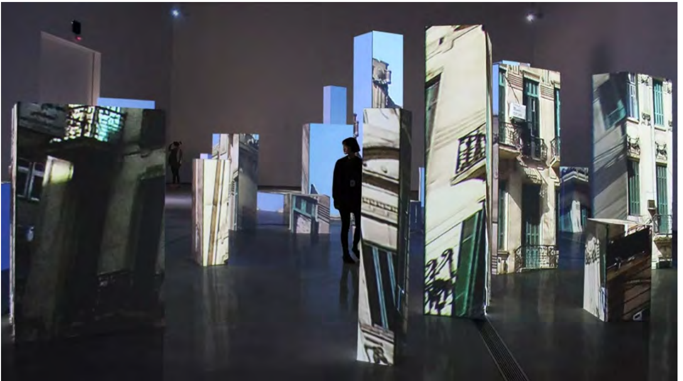
Marc Lee, "10.000 Moving Cities", Seoul National Museum of Modern Art

The latest version was completed in 2017