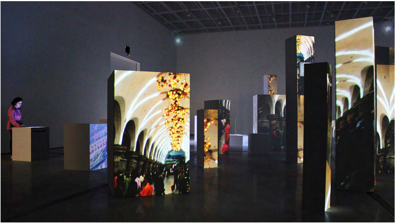
Marc Lee, "10.000 Moving Cities", 2016/2017